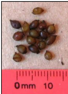
Redworm egg capsules

Add compost to your lawn or garden as a rich, slow-release fertilizer. Fertilize houseplants by mixing about two teaspoons of castings with water and add weekly to your houseplants.